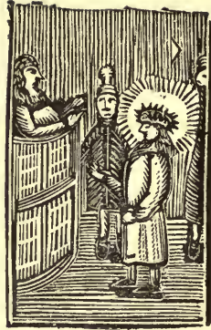
Christ brought before Pilate.

The inscriptions are placed beneath the cuts exactly as they stand in the original sheet.